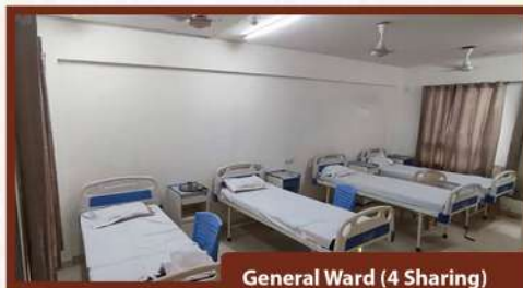
General Ward (4 Sharing)