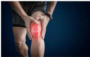
JOINT PAIN & ARTHRITIS

Physiotherapy tackles diseases and injuries that restrict the ability of a person to move around and do functioning in their everyday life. Physiotherapy is a branch of healthcare that assists individuals with mechanical strength, motions, manual treatment, workout therapy, electrotherapy, restoration and maximization of strength, function, and well-being to enhance quality of life. We focus largely on the back, necks, postural issues, joint and muscle discomfort, arthritis, geriatrics, cardiorespiratory disorders, ophthalmology, neurology and athletic injuries.