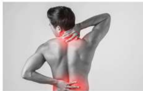
LOW BACK PAIN/ DISC PROBLEM