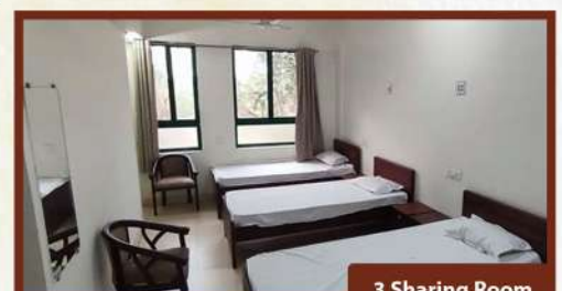
3 Sharing Room