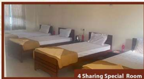
4 Sharing Special Room