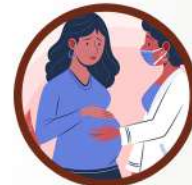
Disease During Pregnancy